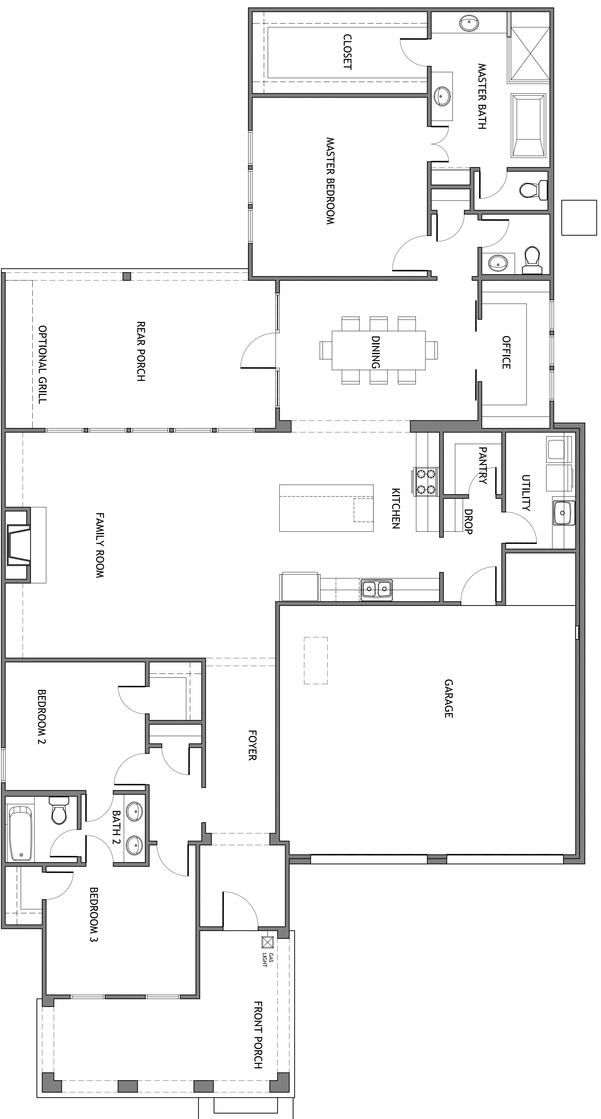
floor plan scaled at 1/4" = 1'-0"